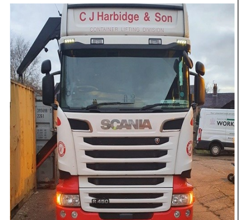
Container 'Kings' starting out en route to Zambia.

You can read more about Workaid at www.workaid.org